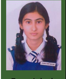
Tanya Lokesh Pallavi Model School

Paul is believed to be hatched from an egg in January 2008 at England and currently living in a sea tank aquarium of Germany. His name derives from the title of a poem by the German children's writer Boy Lornsen. Sea Life Centres, commercial sea life themed exhibitors own the eight legged octopus, which is used to provide enthusiasm among visitors in their panoramic windows displaying the real sea life.